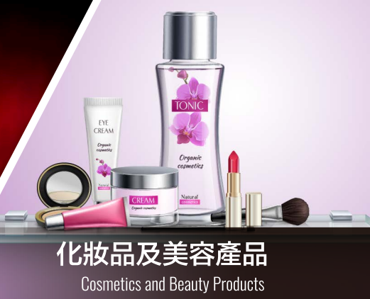
化妝品及美容產品 Cosmetics and Beauty Products