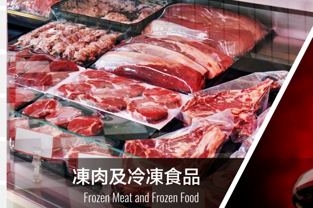
凍肉及冷凍食品 Frozen Meat and Frozen Food

is a versatile point-of-sale (POS) solution with comprehensive features that supports expansion. The system is connected to both front- and back-end software and hardware, effectively shortening the process of front-end payments and back-office operations. TPOS + helps you manage four key areas: purchase, wholesale, inventory and retail. Whether you want to restock an item or deliver it, either scan the barcode on the product or enter its number or name. Bills and other relevant documents are printed automatically and instantly, while real-time inventory tracking is also available. By analyzing data generated by the system, you can easily keep track of your sales and inventory, which helps to improve your business efficiency and competitiveness in the market.