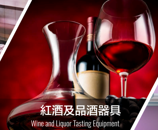
紅酒及品酒器具 Wine and Liquor Tasting Equipment